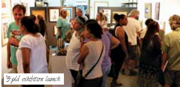
'3-pla' exhibition launch