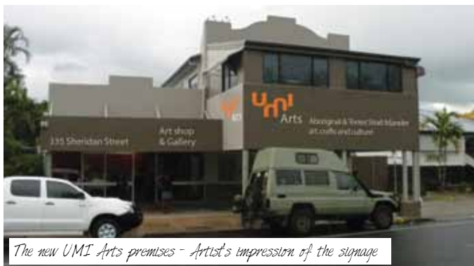
The new UMI Arts premises - Artist's impression of the signage

Our new home has a street frontage and provides gallery and retail spaces, a large flexible workshop area as well as meeting areas and offices. Apart from our street address, all other contact details for UMI Arts will remain unchanged. Please see our web site for more details.