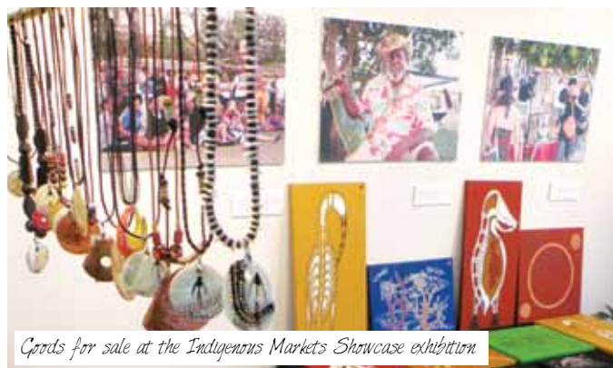
Goods for sale at the Indigenous Markets Showcase exhibition

The UMI Arts Indigenous Markets are a celebration of Aboriginal and Torres Strait Islander arts, crafts, performance, dance and music. They are held at the Cairns Esplanade during the dry season months, between May-October. See related article on page 5 of this newsletter for specific dates.