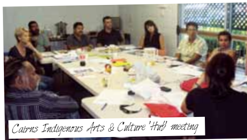
Cairns Indigenous Arts & Culture Hub meeting