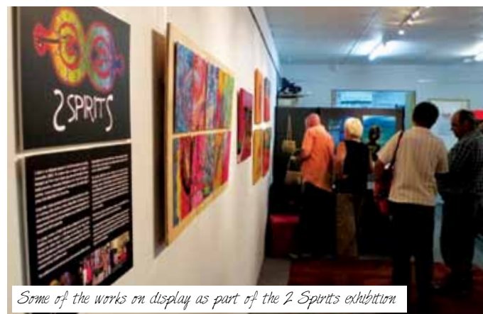
Some of the works on display as part of the 2 Spirits exhibition