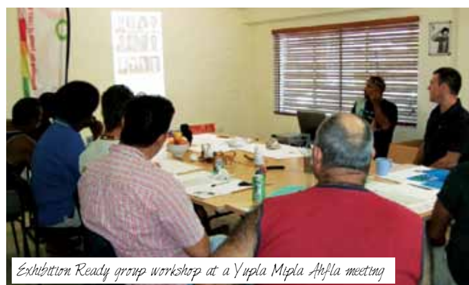
Exhibition Ready group workshop at a Yupla Mipla Ahfla meeting

For more information on the 2 Spirits program, visit www.qahc.org.au or phone 1800 177 434.