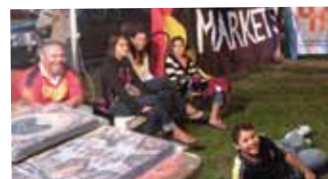
There will be 5 days of Markets in August during the Big Talk One Fire Indigenous Cultural Festival in Cairns!