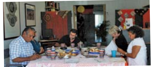
Board meeting discussions