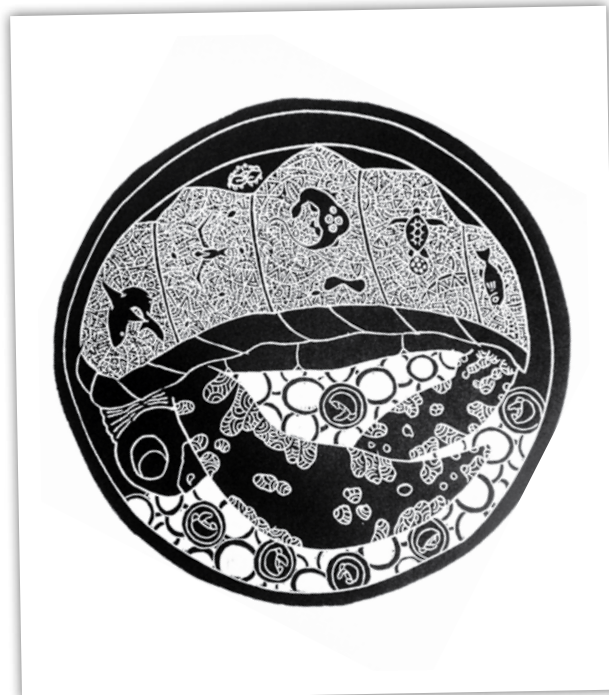
This linocut represents the hardship of baby turtles, while they are still in the egg. The dangers are shown on the back of the baby turtle. The dangers shown in the linocut are goannas, other turtles digging up their nest and humans.