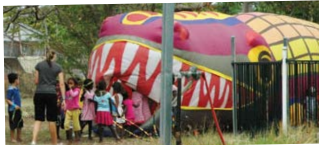
Kowanyama State School Kids with their Teacher

Kowanyama Aboriginal Community is located 600kms by road from Cairns and 25 kms from Cape York Peninsula's Gulf of Carpentaria coast and is situated within the Kowanyama DOGIT (Deeds of Grant in Trust) lands.