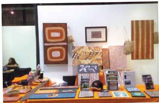
UMI Arts Stall at the Tanks Arts Centre

The Tanks Market Day coincided with an exhibition of artworks that were also on display in Tank 4. The exhibition included artworks by 21 Aboriginal and Torres Strait Island artists.