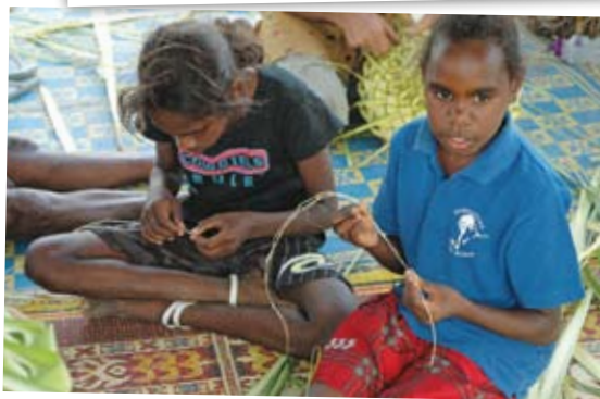
Kowanyama Kids Weaving