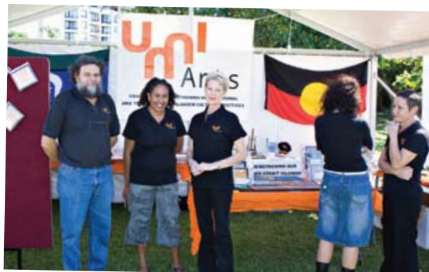
UMI Arts Presence at NAIDOC celebrations

The NAIDOC celebrations in Cairns are an important way of keeping the community informed about UMI activities and projects.